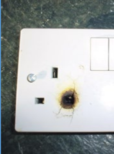
Typical examples of potentially dangerous electrical installations